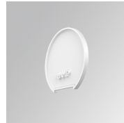
Product code: L6SUECW