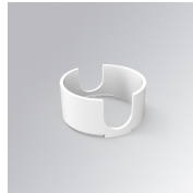
Product code: K71SUADLATWH