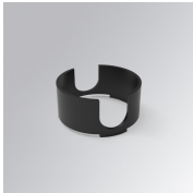
Product code: K71SUADLATBK