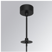
Product code: K71SUCAWI2000DBK K71SUCAWI2000NBK