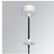
Product code: K71SUCAWI2000DWH K71SUCAWI2000NWH