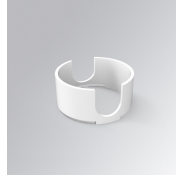
Product code: K71SUADLATWH