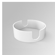
Product code: K11SUADLATWH