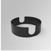
Product code: K11SUADLATBK