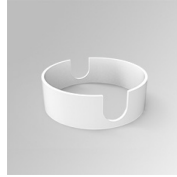
Product code: K11SUADLATWH