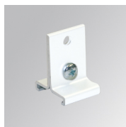
Product code: TKASUSSUW

Description: TRACK ACC. SUSP SUPPORT WH.