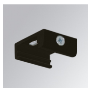
Product code: TKASRSUB

Description: TRACK ACC. STEEL CABLE 3M WH.