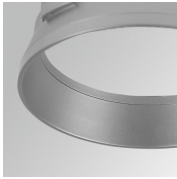
Product code: HS2RI90M