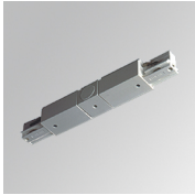
Product code: TKAAIDNW