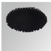
Product code: HSHO50

Description: HANCE 1000/2000 ACC. CUTTING BEAM