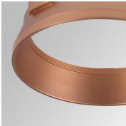
Product code: HS2RI90C