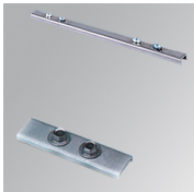
Product code: F5JO