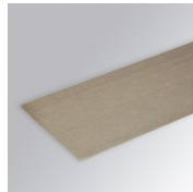
Product code: AM2ACIN030ACH